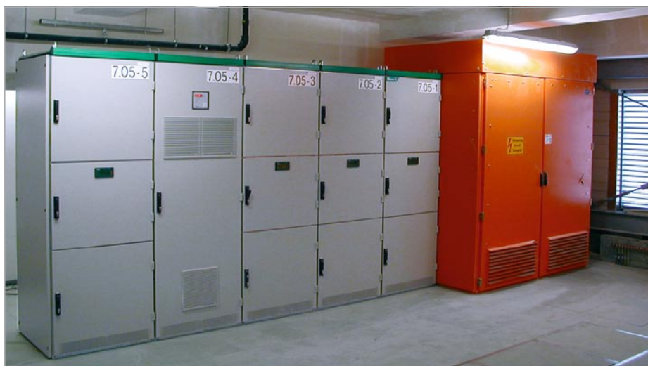
Load-centre substation with MODAN® and directly connected transformer in the enclosure

Moeller’s scope of delivery and performance included the medium-voltage station – designed as a 10 section EA10 installation, the load-centre substations (without transformer) with a total of 27 MODAN® sections, 470 metres of LD busbar trunking systems for