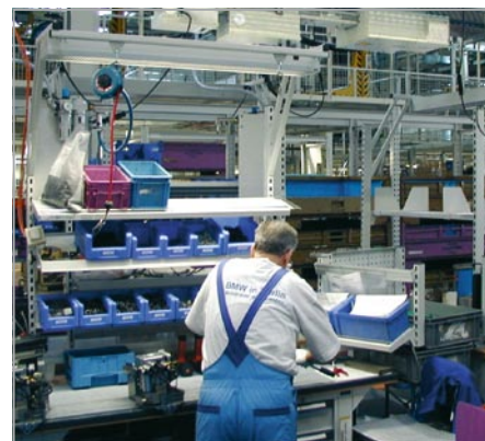
BD2 as trunking system

meshing / supplying the power, and 420 metres of BD2-400 as a trunking system, including installation.